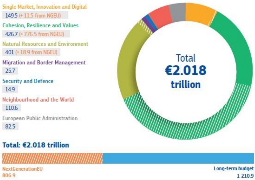
Figure 3 Expenditure & Categories, MFF 2021-2027

Wrapping up this discussion of budgetary expenditures, Figure 4 is a pictograph with the size of the circles illustrating the relative weight with respect to other expenditures, allowing the reader to compare the continued dominance in the EU’s budget of cohesion policy and the CAP vis à vis “newer and reinforced” priorities.