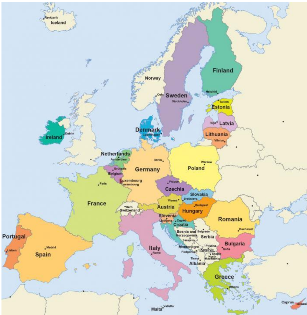
Figure 1 Map of the EU's 27 Member States

This section 2 provides an overview of the European Union and is not intended as a substitute for the many excellent general texts. The following topics are considered: Member States, Treaties, Integration Typology, Institutions, and EU Policies.